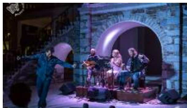
“Tzares”... From Smyrna to Istanbul, Poseidonia, Thursday 03/08/18