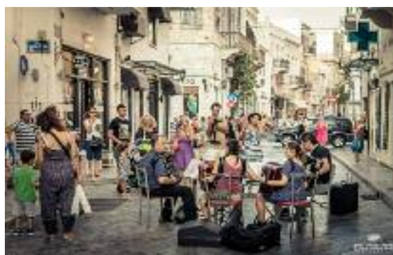
Participants of the Festival in the town of Ermoupolis