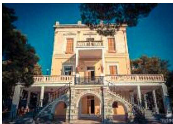
The Mansion of Saint Paul in Poseidonia,