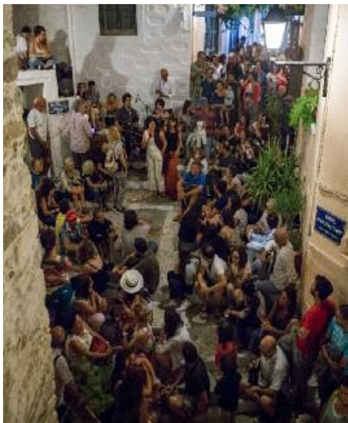
«Bam»... Greece, the balkans and eastern mediterranean, Ano Syros, Monday 31/07/18

Additionally, we provide the participants, the guest musicians and the volunteers with accommodation at the Saint Paul Mansion in Posidonia Village. This is a historic building, surrounded by gardens with pine trees, which becomes for a whole week the meeting point of musicians, mainly accordionists, from all over Greece and Europe.